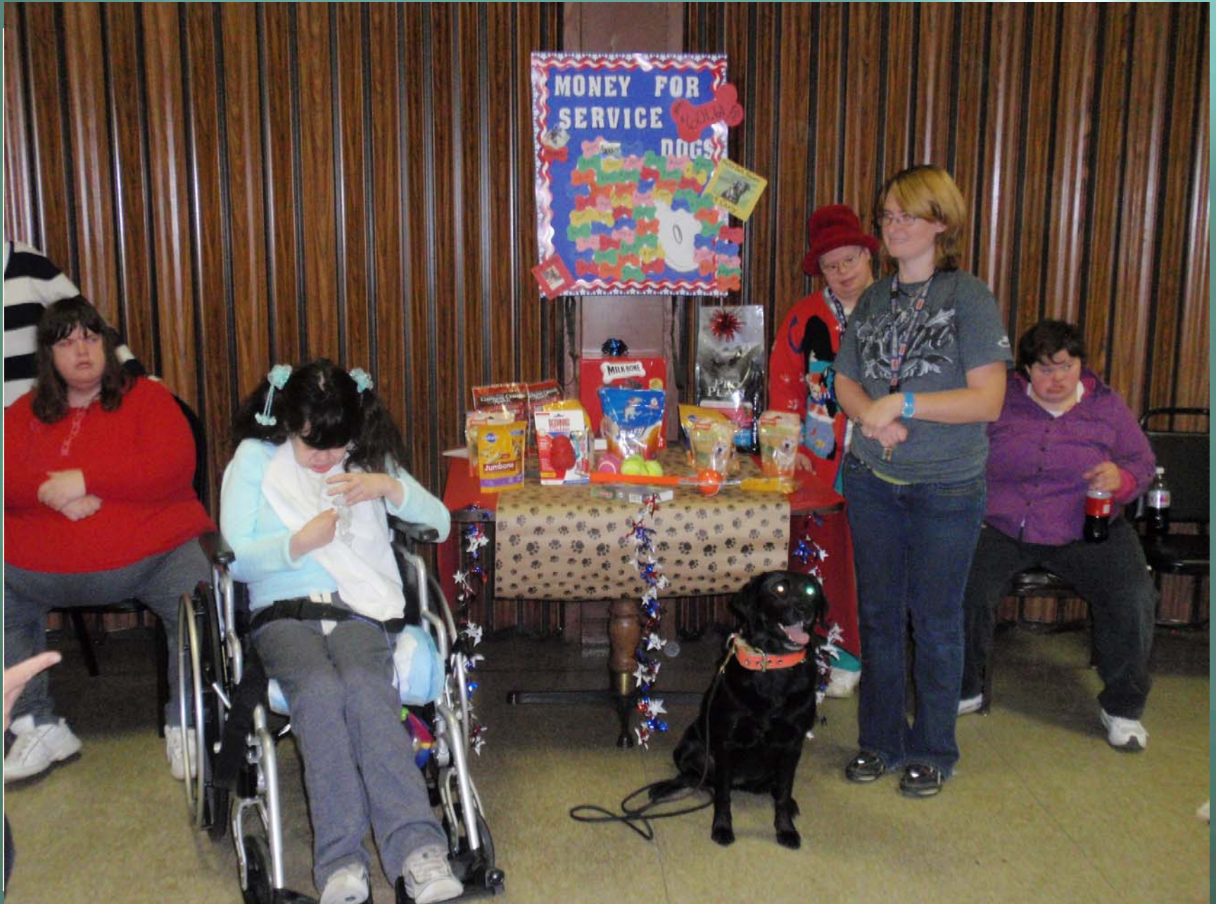
Lake County Board of DD/Deepwood