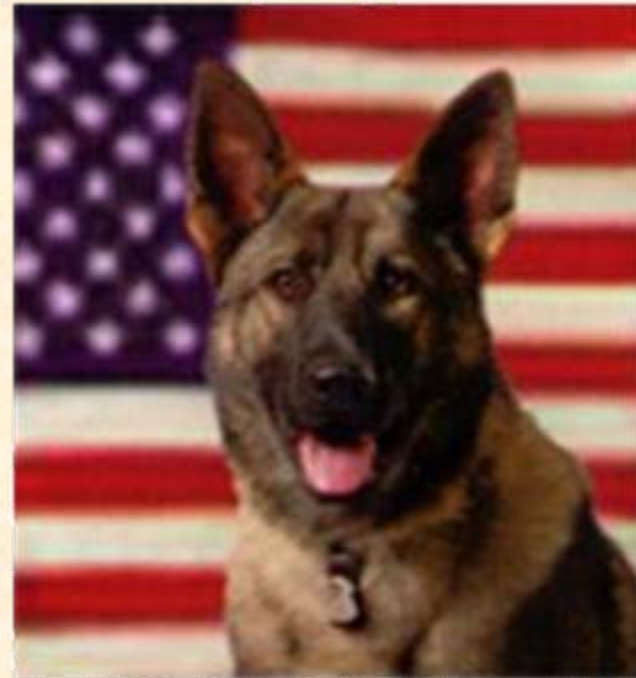
Ekko, one of Eastlake Police Department's K9 units