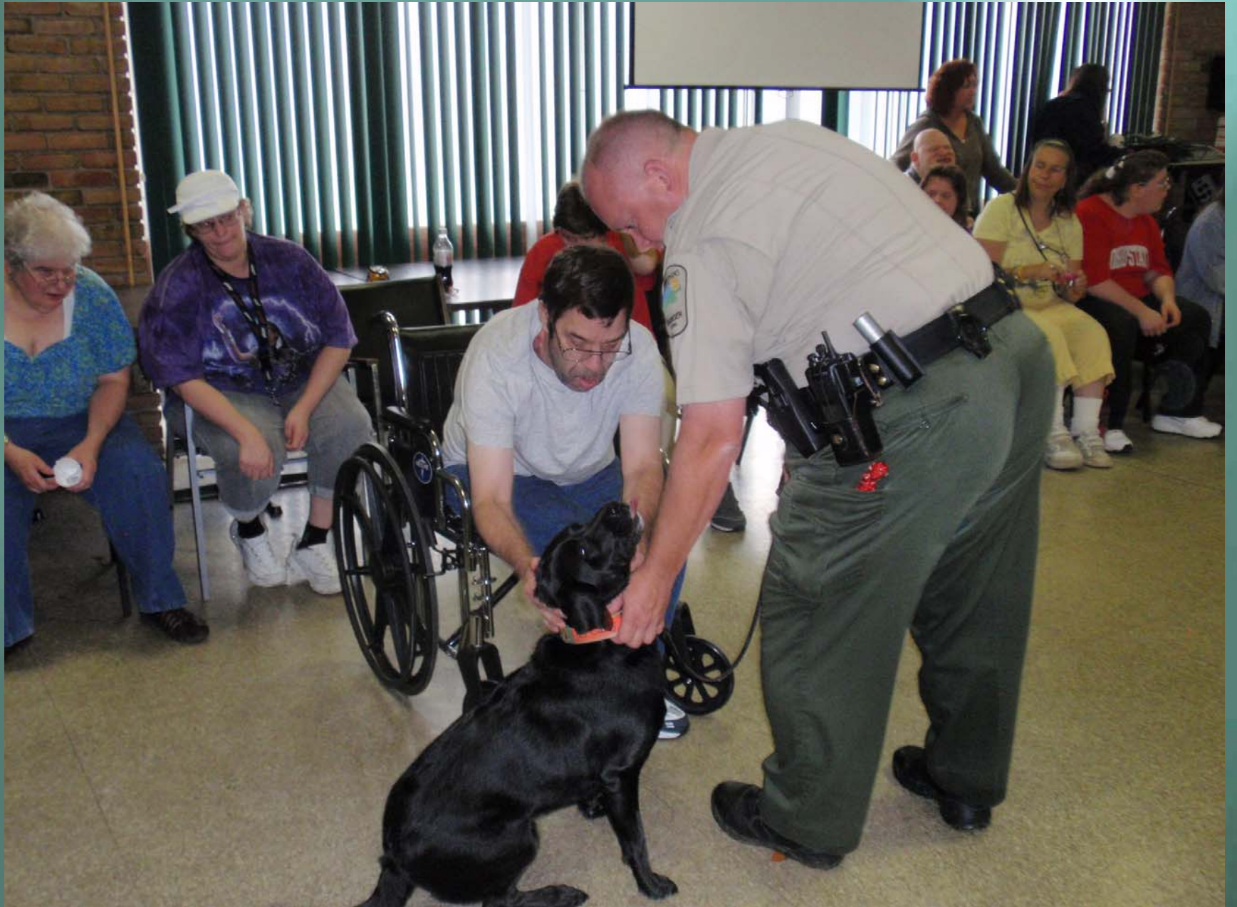
Lake County Board of DD/Deepwood