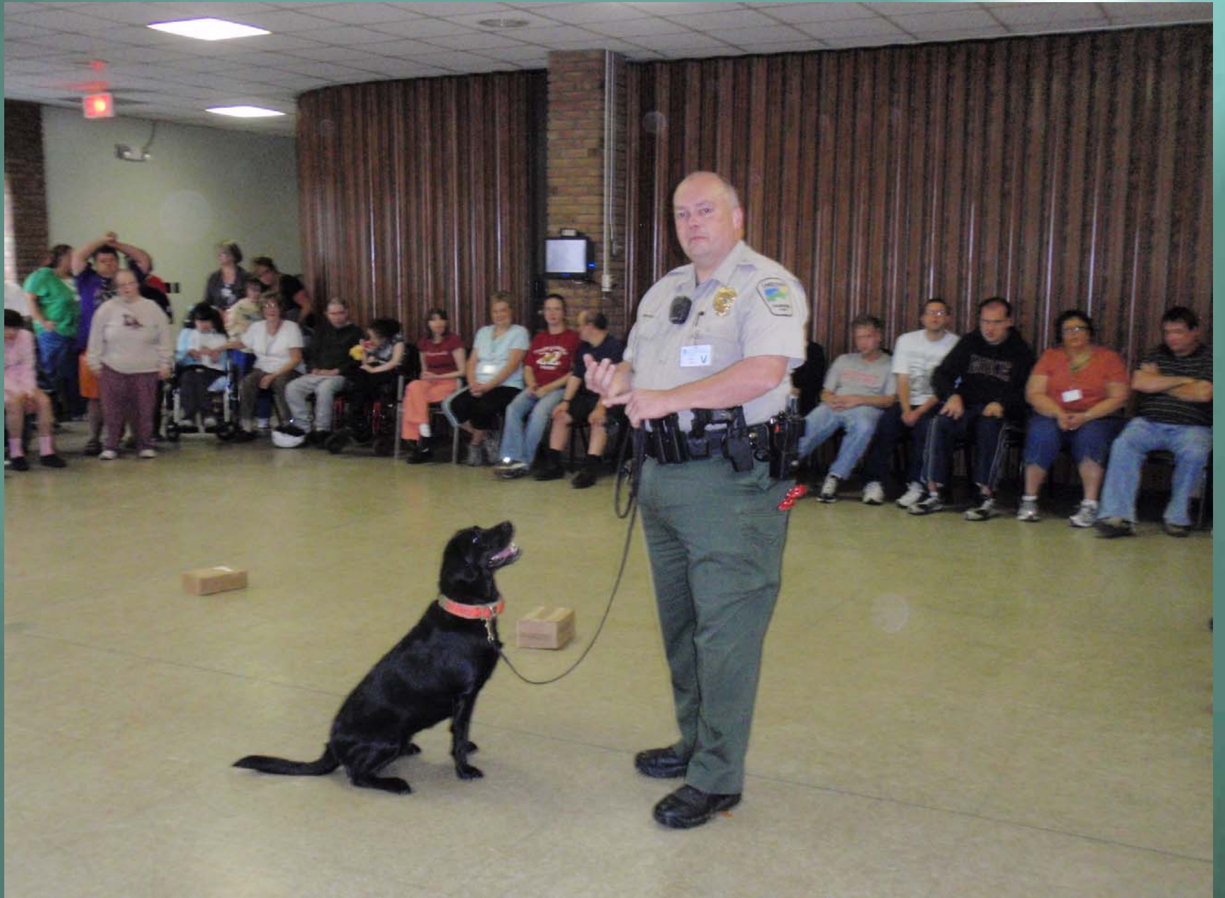
Lake County Board of DD/Deepwood