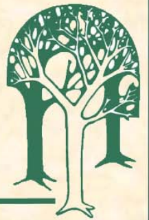
Lake County Board of DD/Deepwood