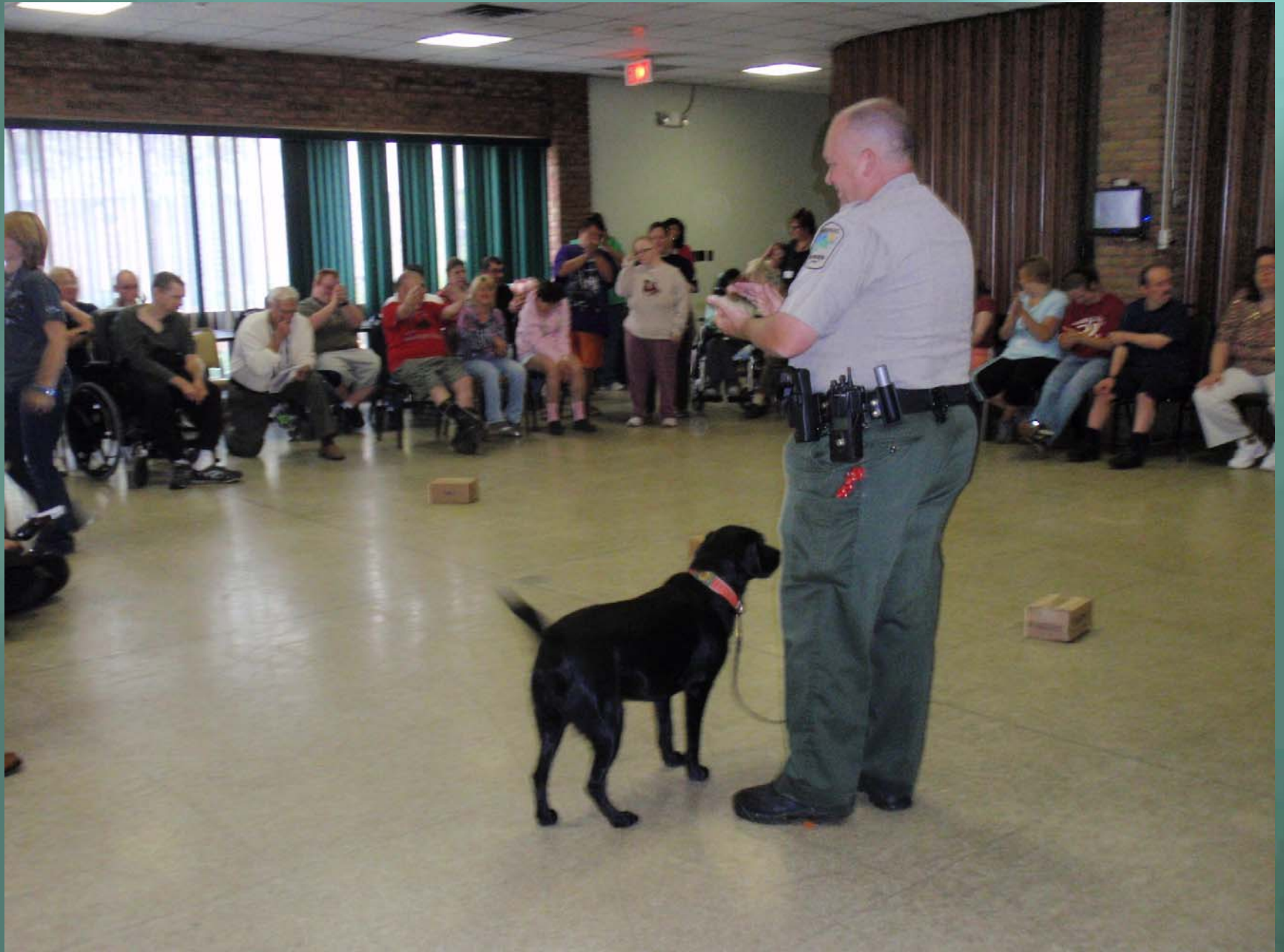
Lake County Board of DD/Deepwood