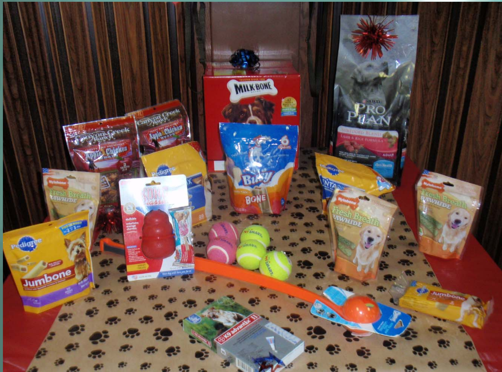
Lake County Board of DD/Deepwood