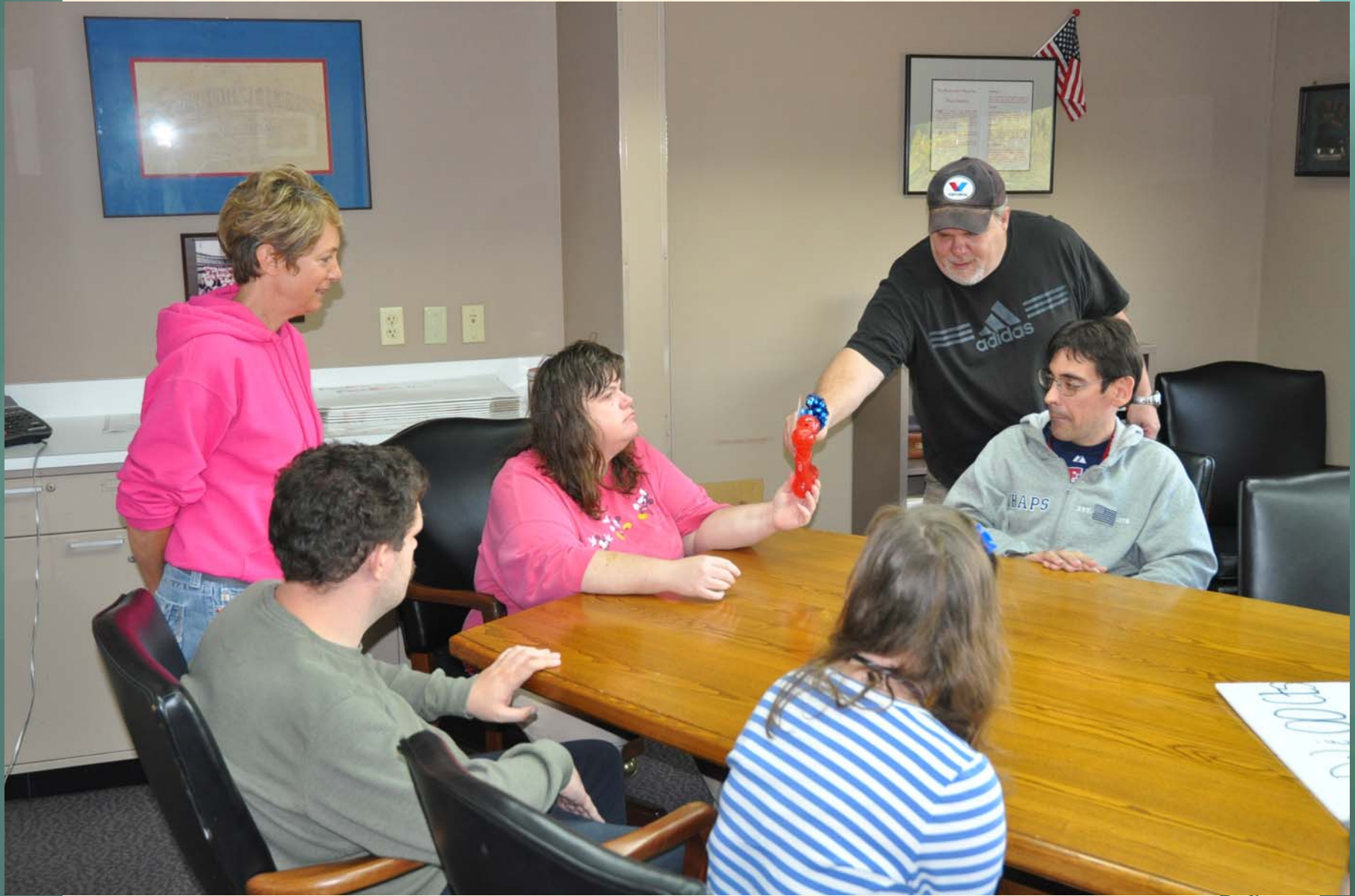
Lake County Board of DD/Deepwood